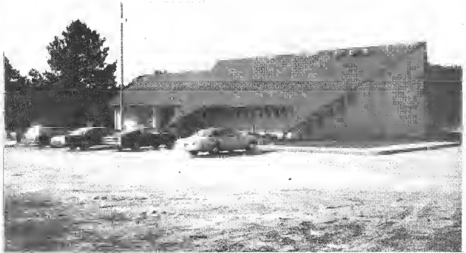
BONANZA UNITED CHURCH OF CHRIST

As you remember the members of your own immediate family this Christmas, remember, too, the retired senior servants of our larger family, the church. Please give generously.